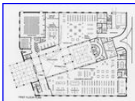
Ground level floor plan