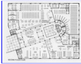
Second level floor plan