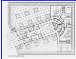
Fourth level floor plan