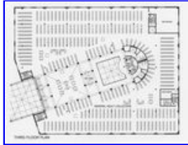
Third level floor plan