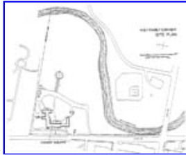
Existing site plan

This report was required for the Sister's ruling order in Rome for this complex resolution.