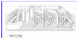
Perspective of treatment rooms