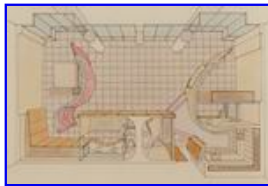
Perspective showing re-configured apartment

These curvilinear forms and light transparency provided an artistically-sculptured apartment with minimum cost.