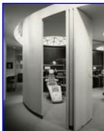
Typical treatment room