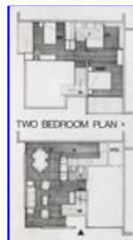
Floor plan of two-bedroom unit