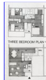
Floor plan of three-bedroom unit