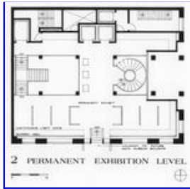
Second level floor plan