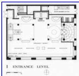
First level floor plan