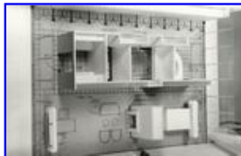
Model photo of interior