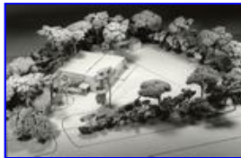
Model photo showing surrounding site

The second level of the carport provided generous square footage for this bedroom suite. There was a need for a private living separate from the very open and exposed living room... The area above the redesigned garage was developed into an intimate sitting area with a fireplace, a study area, a grand washroom with whirlpool tub, a generous storage facility, and a pleasant sleeping area.