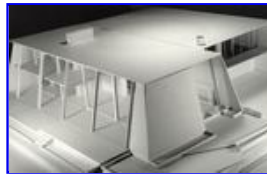
Model photo of house